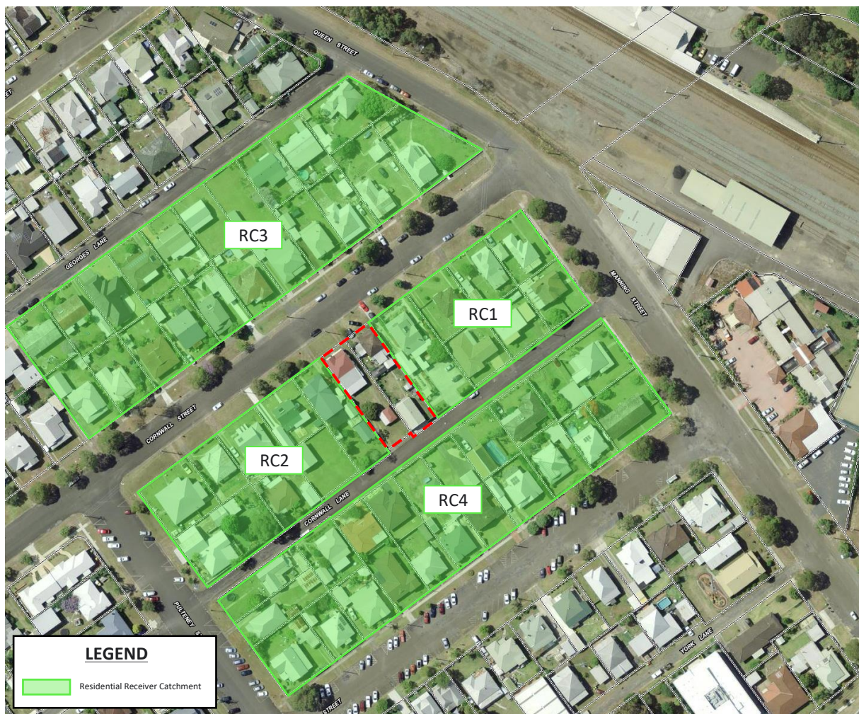
Figure 1: Aerial image and boundaries of site

The location and boundary of the proposed development and the surrounding noise-sensitive receivers are shown in Figure 1. The noise-sensitive receivers have been delineated into receiver catchments (RCs) as noted in Figure 1 and have been identified as comprising of general residential receivers.